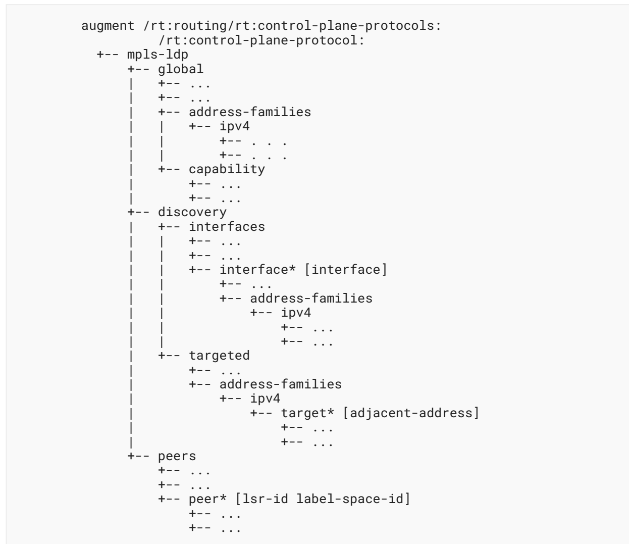
Figure 3: Base Configuration Organization

The following is the high-level configuration organization for the base LDP module: