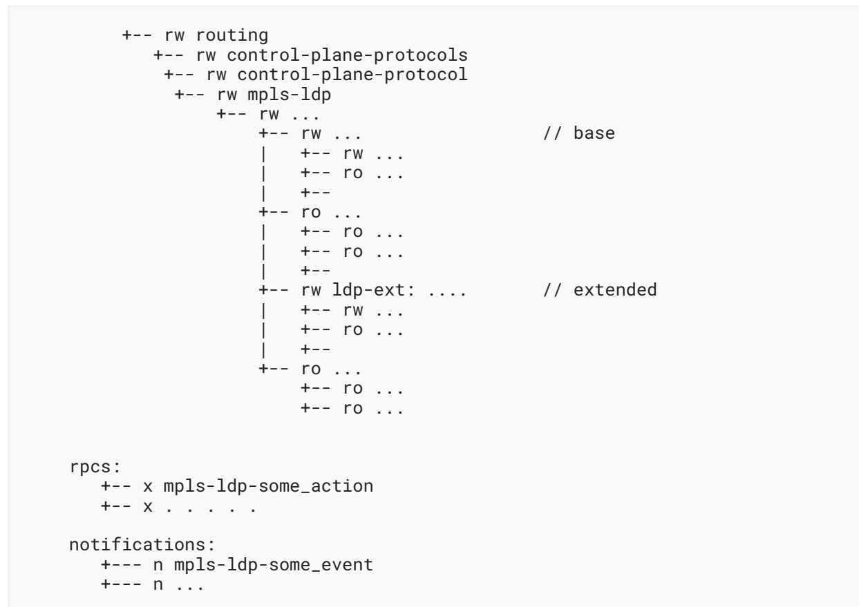
Figure 1: LDP YANG Tree Organization

The following diagram depicts high-level LDP YANG tree organization and hierarchy: